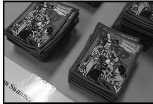
Indian Summer patches for sale in the OA Trading Post.

of Hunnikick Lodge shared his thoughts on the Trading Post. He stated, "It was awesome there. There was a lot to choose from and I loved the figurines and merchandise from all of the most recent events."