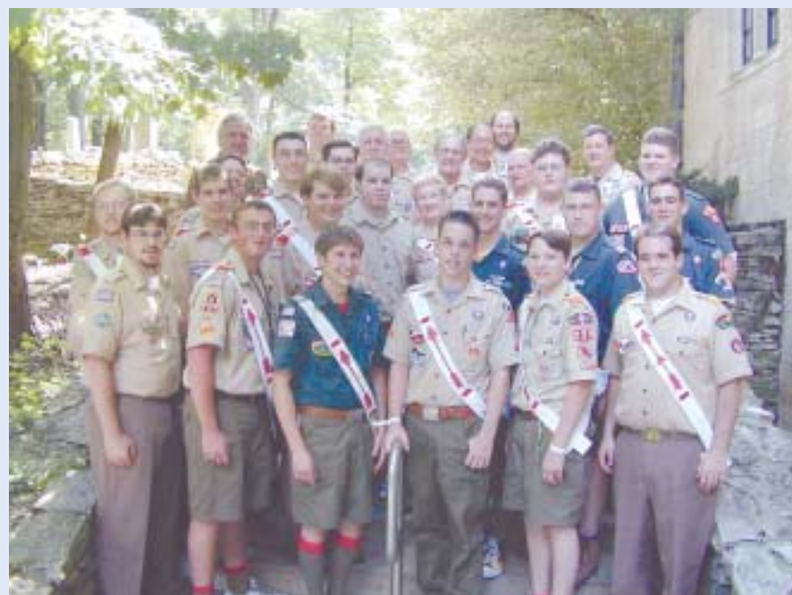
NOAC Discoverer Staff